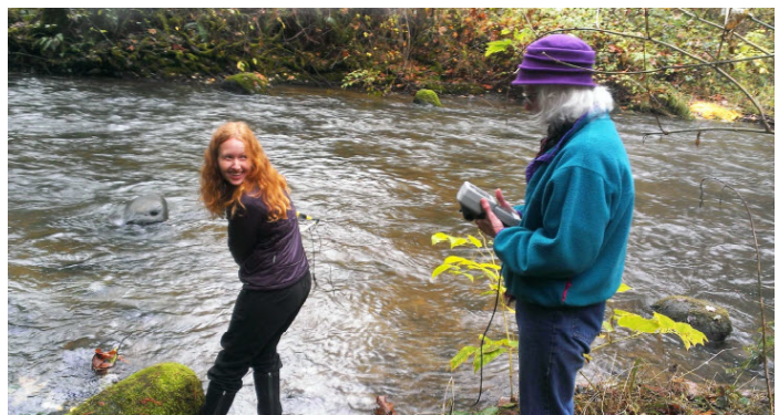
Figure 2: Stream team volunteers taking water quality samples.