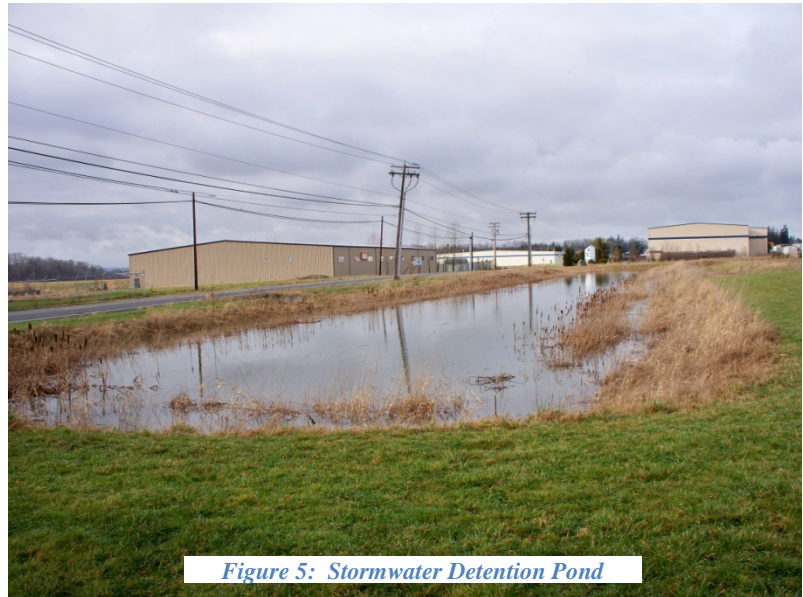
Figure 5: Stormwater Detention Pond