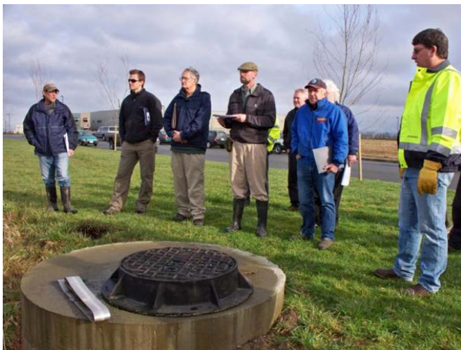
Figure 6: Private Stormwater Facility Workshop