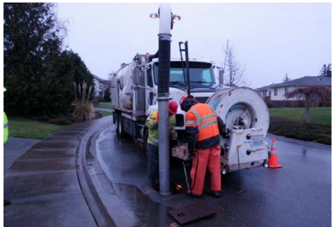
Figure 7: Public Works Crew Using a Vactor Truck